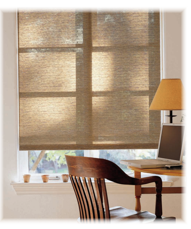
Closing your shades or blinds saves energy by preventing the sun's heat from warming your home.

to reduce the loss of cool air already in our home. Lastly, programmable thermostats are a great tool to adjust set points in the home when we are sleeping and when we are away.